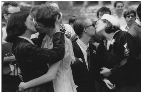
Photograph from Weddstock protest, 1992.

Posted on March 10, 2015 by The University of Chicago Library