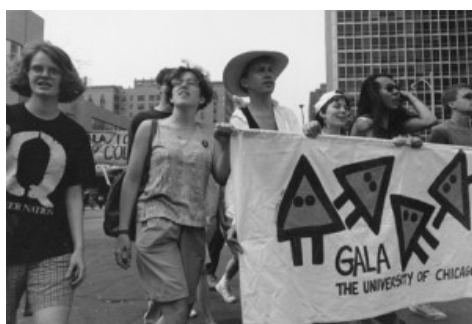
Photograph from Chicago Pride Parade, 1991.

Celebrate the opening of the exhibition Closeted/Out in the Quadrangles: A History of LGBTQ Life at the